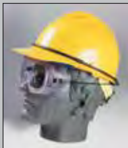
GR9562 CAP MODEL

Checkers Goggle Retainers are designed for use where protective eyewear must be worn with a safety hat or cap. These retainers install quickly and easily with no tools required. Goggle retainers will retain the goggle on the safety hat or cap when the goggle is not in use, and hold the goggle securely when worn for eye protection. Goggles, cap or hat not included.