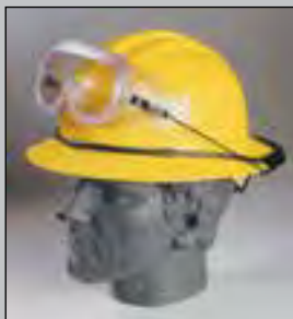
GR9662 HAT MODEL