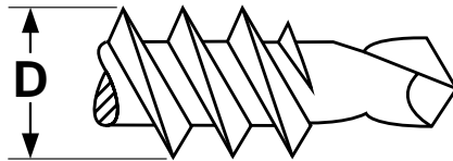
Fine Thread Drill Point Drywall Screw